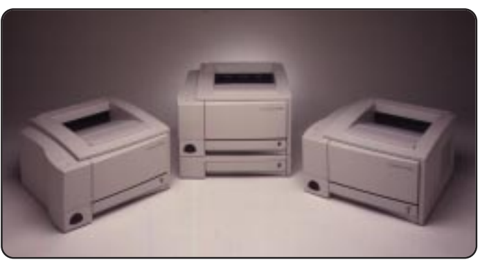
HP LaserJet 2100, 2100TN, 2100M