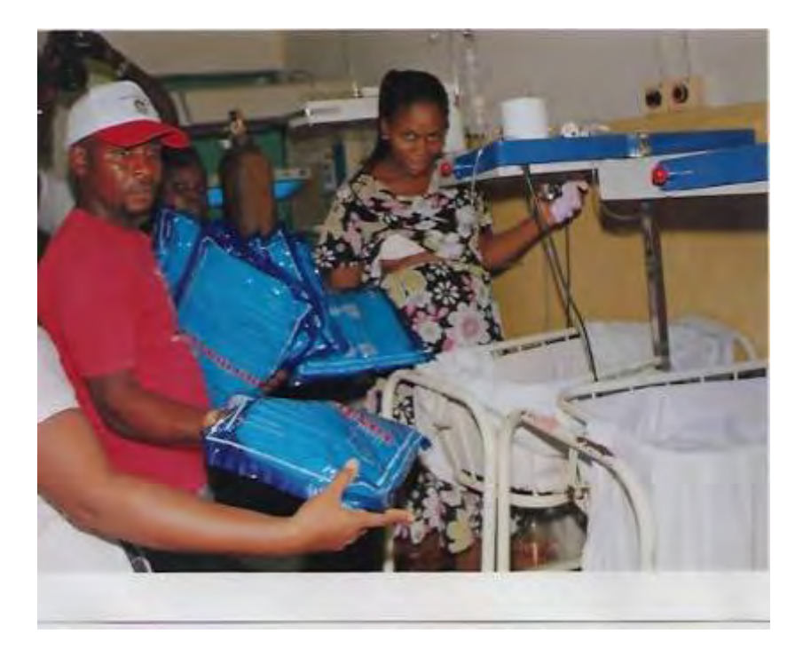
PREMATURE BABIES UNIT AT IRRUA TEACHING HOSPITAL WITH STAFF