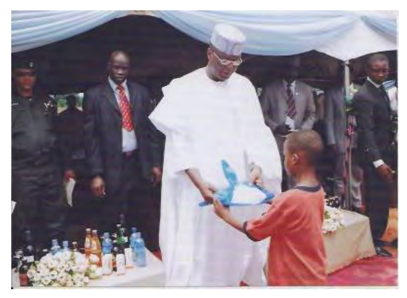
THE GOVERNOR GIVING THE TORN NET TO A LITTLE BOY