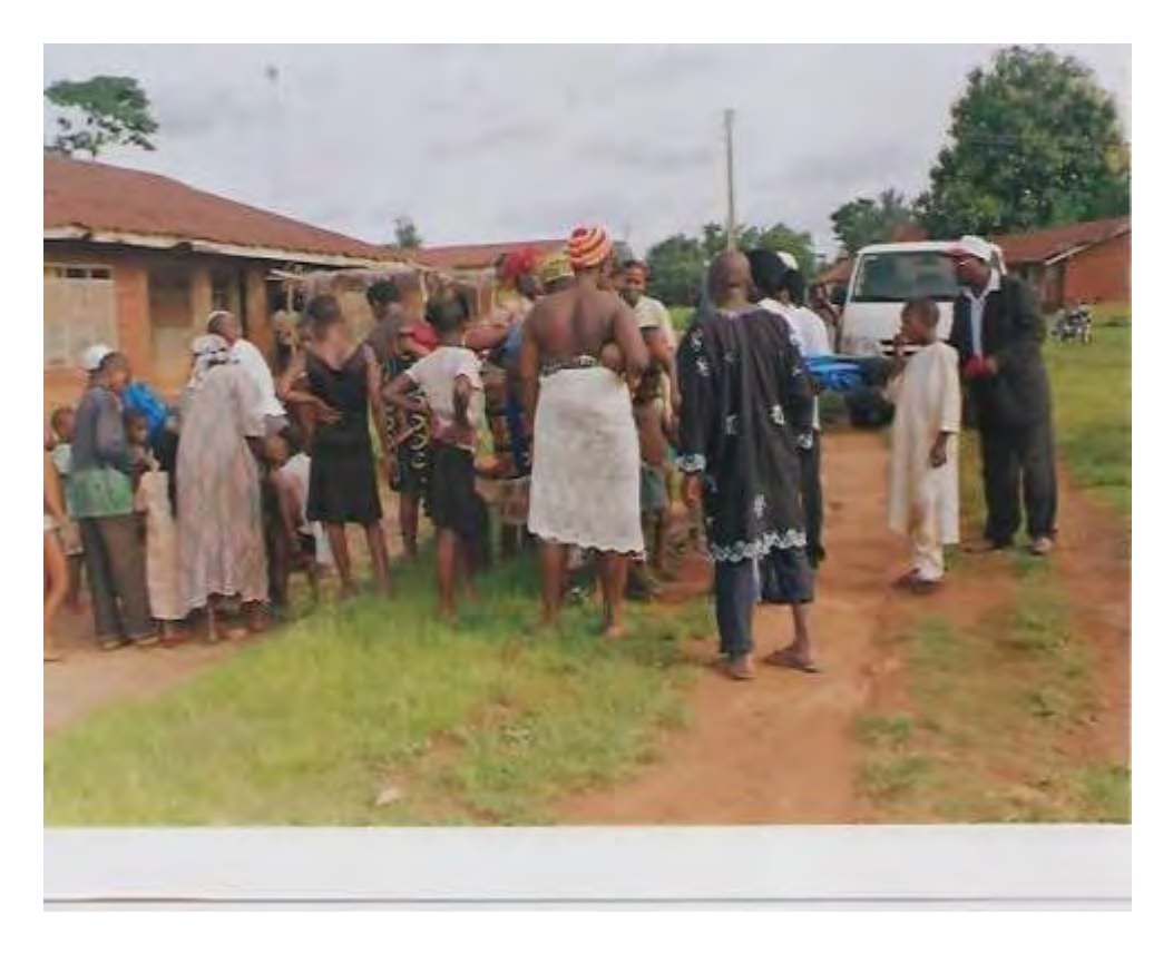
VASS TEAM WITH SOME VILLAGERS IN ONE OF THE VILLAGES VISITED