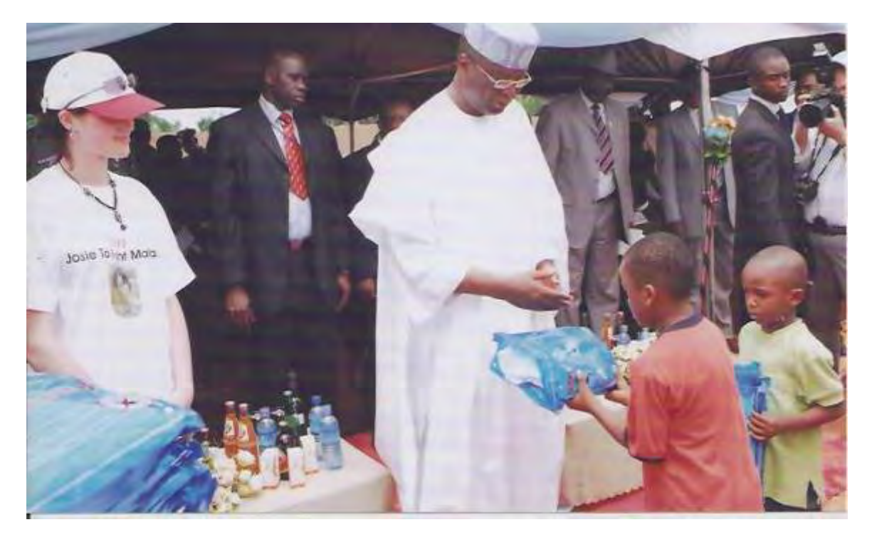
THE GOVERNOR OF EDO STATE GIVING OUT NET TO A LITTLE BOY