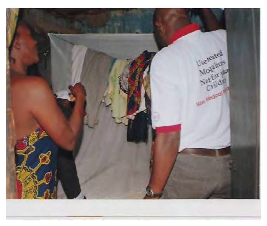
HELPING A PREGNANT WOMAN TO SET UP HER NET IN HER BEDROOM