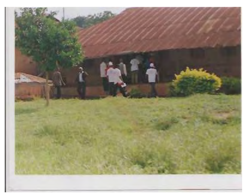
VASS TEAM ENTERING ONE OF THE HOUSES IN A VILLAGE

Our second visit to Irrua took us to the Local Government headquarters of Esan Central Local Government Area. We met a very large crowd of enthusiastic women, children and men; the large crowd was partly due to the fact that a day earlier, the local government authority had instructed a town crier to announce to the whole community of our intending visit to distribute treated mosquito nets free. We were introduced to the community as usual and we made the women and children to form five straight lines where names, addresses, age, gender etc were collected from them and nets given out to those pregnant and children below five years of age, it was quite hectic on this day due to the large crowd and we were able to give out a total of 3,120 nets. Please see picture below.