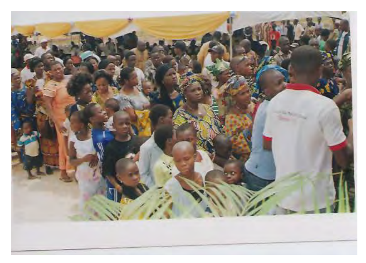
PART OF THE CROWD AT JOSIE RUSSELL CHILDREN HEALTH CENTRE