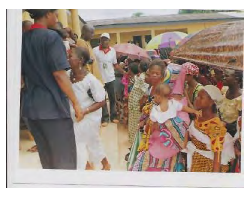
CROWD AT ESAN CENTRAL LOCAL GOVERNMENT, IRRUA

Our second visit to Irrua took us to the Local Government headquarters of Esan Central Local Government Area. We met a very large crowd of enthusiastic women, children and men; the large crowd was partly due to the fact that a day earlier, the local government authority had instructed a town crier to announce to the whole community of our intending visit to distribute treated mosquito nets free. We were introduced to the community as usual and we made the women and children to form five straight lines where names, addresses, age, gender etc were collected from them and nets given out to those pregnant and children below five years of age, it was quite hectic on this day due to the large crowd and we were able to give out a total of 3,120 nets. Please see picture below.