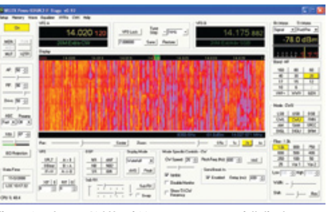
Figure 2 — Lower 40 kHz of 20 meters as a waterfall display.