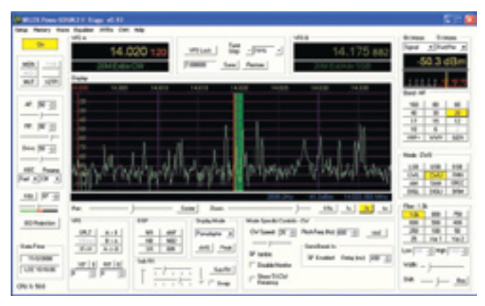
Figure 3 — Display of Figure 1 narrowed to show lower 40 kHz of the band.